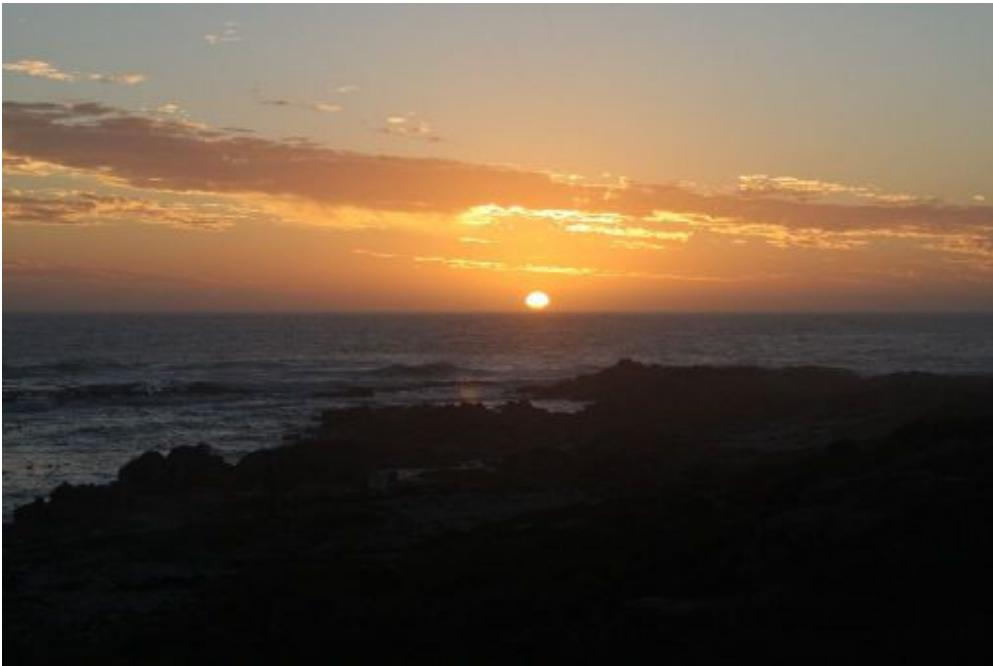
And this is what Boggerolbaai looks like now...