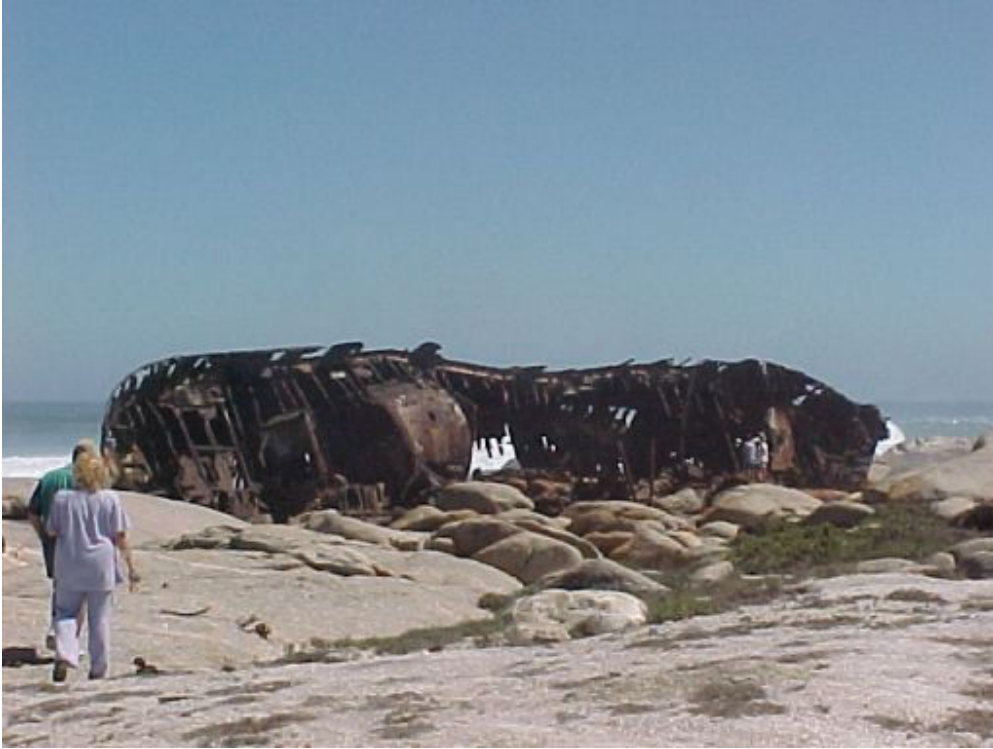
Wreck of the Aristeia in 2010